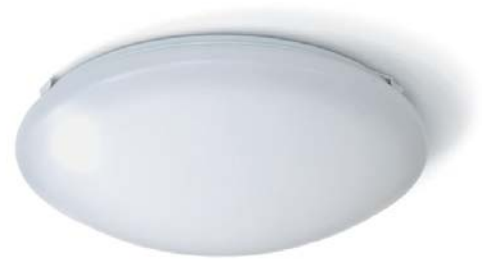
fully integrated unit

'Instant-ON', 13" & 16" Oyster LED lights with greater and more ambient illumination replacing circular fluoro tubes or Dual-CFL in Oyster fittings. Lower your electricity bills instantly and eradicate UV radiation, Mercury and other dangerous chemicals from homes, apartments and hotels.