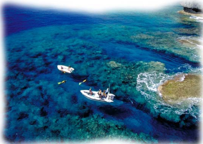
Divers & the crystal clear waters of Niue.

The Fans - A beautiful garden of over two dozen Gorgonia Fans at a depth of 30-40 metres (100-130ft) The site also features a