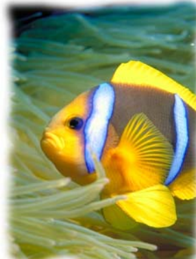
Friendly marine life - Niue.

lace the limestone mantle. Some of the other highlights are two cave trips with stalactites, stalagmites and one of the best rain forest walks in the Pacific, and a Circle Island Tour. Available for hire are; motor bikes, scooters, cars, mountain bikes (forrideres in the bush). Stunning snorkelling and natural swimming pools, scuba diving, landbased game-fishing and light tackle sportfishing are just some of the activities that will fill your days.