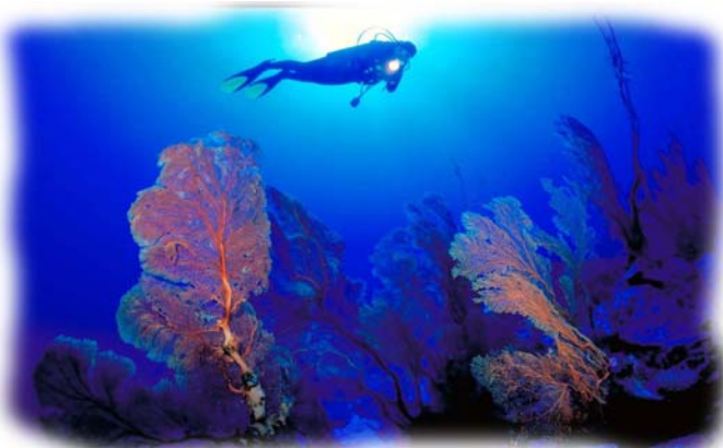
Exploring the deeper drop-offs

Limu Twin Caves - One of the many great cavern dives around Niue - from a pretty reef top you descend into a world of light