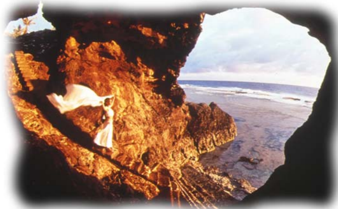
Spectacular scenery - Niue.

Niue is a very special South Pacific island destination, situated 410km east of Tonga across the dateline. It is a single island, the largest coral land mass in the world and is affectionately known as "The Rock". "The Rock" is blessed with great natural beauty inland, a unique rugged coastline and small reef that provides superb fishing, diving and snorkelling. The surging Pacific Ocean has created soaring archways, deep chasms, cool caves, fascinating rock pools and intimate swimming coves around the island. As a fringe of coral reef clings to Niue's sides before plunging to abyssal depths, there are no sandy beaches. Nor are there streams or rivers on the island; the rain filters through the porous coral out into the warm Pacific Ocean completely devoid of any silt runoff. This allows the surrounding sea to be crystal clear (it doesn't get any clearer) with water visibility often reaching up to 70 metres. A walk in the tropical rainforest is a "must do", as is visiting the stalactites, stalagmites, caves