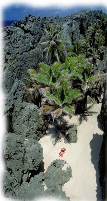
Secluded patch of sand - Niue.

Namukulu Motel: Has three beautifully appointed self-contained studio rooms set in lush tropical gardens with sweeping sea views from the deck & lounge. Your unit is complete with kitchen facilities & pots & pans, and is well geared up for self catering. There is a walkway down to the sea and a lovely natural swimming pool and excellent snorkelling. Namukulu has a nice BBQ area and fantastic swimming pool with great views.