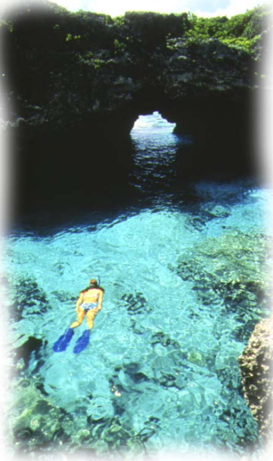
Spectacular snorkelling - Niue.

Avatele dives are a photographers dream both above and below water. The dive boat departs from a beautiful small lagoon used by locals to swim and launch their fishing canoes or 'vaka'. Dive sites are close to traditional fishing grounds and in sight of The Matavai Resort with it's sweeping views of the bay. Along with clear water, coral gardens and an abundance of colourful reef fish and frequent sightings of the timid Niuean sea snake, you may encounter pelagics, reef sharks or maori wrasse. If caverns are your interest then try the dive below Namukulu Motels, two enormous joined caverns you could park several buses in.