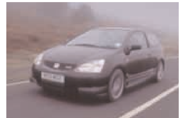
The Type-R is the car for the hardcore type who loves track days or just looning. The gearlever sprouting from the dash may look weird and stumpy but it's well snicky