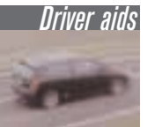
T Sport Toyota uses electronics to keep it on the straight and narrow. Its VSC system uses the ABS sensors to detect wheelslip then decreases engine power and/or applies selective braking to each wheel as required to reduce the likelihood of a slide Type-R As part of its efforts to keep the drive as pure as possible, the Type-R doesn't have any form of traction control other than the driver's sensibilities. Neither does it boast the viscous coupling limited-slip diff seen on the Type-R Accord and Integra. So let's be careful out there

honed in a wind tunnel. In black it is all the more menacing – as if it were designed for the racers of Tokyo's Midnight Club.